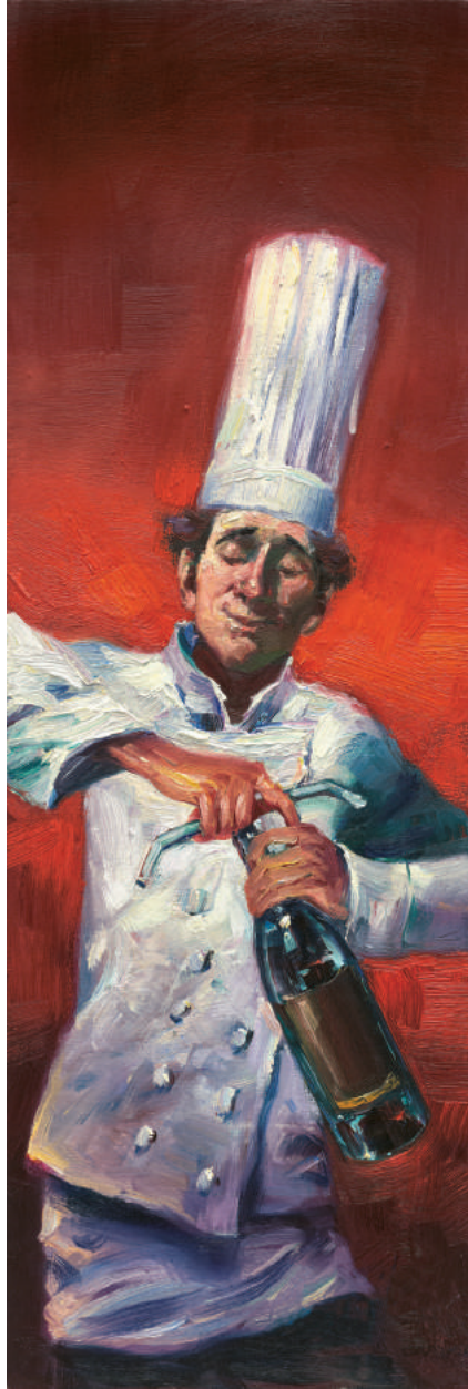
Mixed Media on Canvas