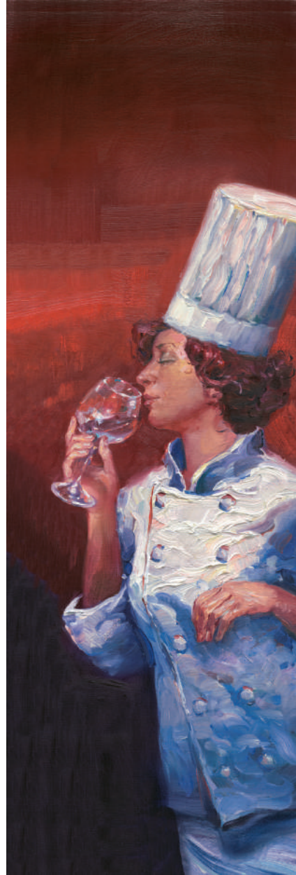
88 S.N., 8 APs